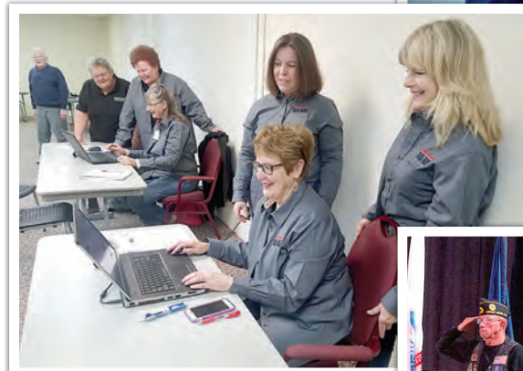
Left - Tax preparation volunteers.