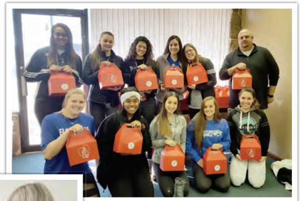
Above - Students from Barton Community College assembling Boxes of Love for seniors.

"This is a big push not only here but across the country. Since non-profits often can't afford to hire extra staff, volunteers could be a solution. And we can help non-profits navigate the avenues to finding the right people." Cont. on Page 8