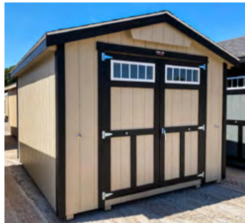
Sturdi-Bilt donated this shed to the Sunflower Diversified Services Charity Gala. More items are needed for the silent and live auctions.

Sunflower serves infants, toddlers and adults in Barton, Pawnee, Rice, Rush and Stafford counties. It is in its 56th year.