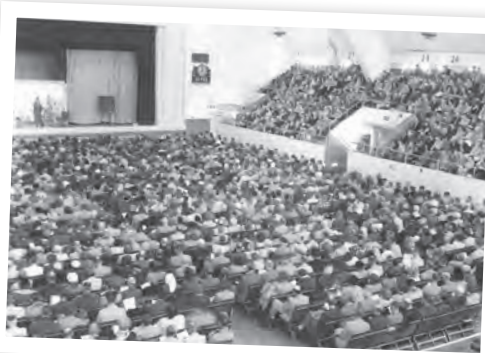
ABOVE: More than 3,000 members attended Central Kansas Electric Cooperative's annual meeting in 1953, held at Great Bend's Municipal Auditorium. The meetings were major community events, with elaborate electricity presentations and state-of-the-art door prizes.