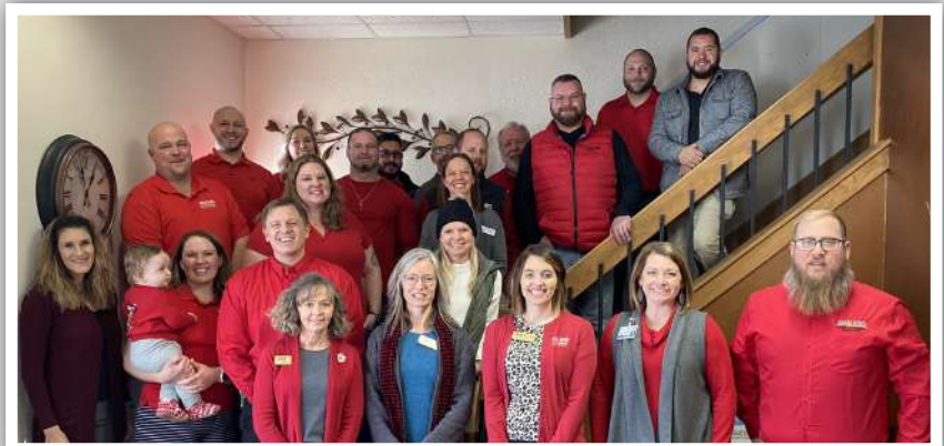
2022 Ambassadors Club

Serve the Community and Expand Your Influence - Serve as a volunteer on one of these committees: Ambassadors Club, Kids Ag Day, Golf Tournament, Annual Meeting, Beautification, Employer Roundtable, Board of Directors.