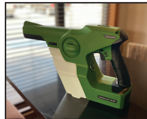
Electrostatic sprayer for sanitizing

3111 10TH ST. • GREAT BEND, KS 67530 • WWW.EXPLOREGREATBEND.COM • 620.792.2750